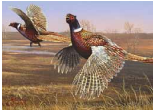
A painting by Scot Storm was chosen as the winning design from among twenty-two entries in the 2006 Pheasant Habitat Stamp contest sponsored by the Minnesota Department of Natural Resources.